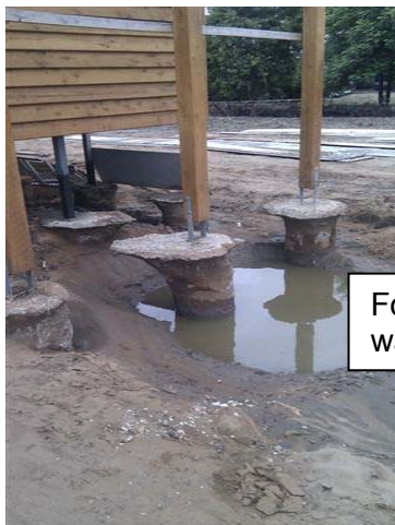
Footings scoured out by fast flowing water

NOTE: Where fast flowing water has impacted on the dwelling, joists and bearers may have shifted/twisted and walls and windows may be out of square etc. Any excessive misalignment should be corrected before new cladding or lining is installed.